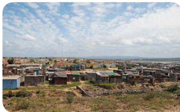
Port Elizabeth, South Africa

27 CENTRAL ASIAN PEOPLES. Workers in one area of Central Asia are encouraged that local believers are sharing with others. Pray for hearts to be opened and for local believers