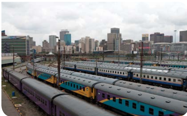
Johannesburg, South Africa

8 ISAAN OF THAILAND. The Isaan people have always used Thai-language Bibles. However, the New Testament is now being printed in Isaan. Pray that God will use His Word to draw many to a relationship with Himself.