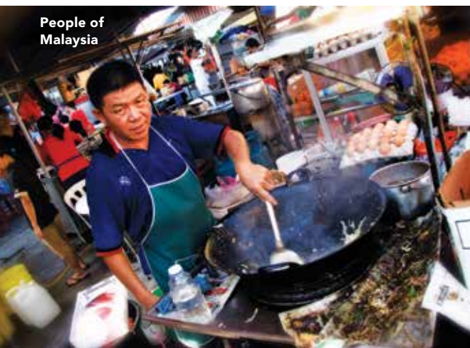
People of Malaysia

16 SOUTHEAST ASIAN PEOPLES. There are few believers among the unreached people groups living in Kuala Lumpur, and many are afraid to witness because of the potentially high cost. Pray for boldness and hearts to see their own people to come to Christ.