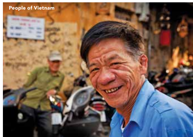
People of Vietnam

27 SOKOTO FULANI OF NIGER (SOH-koh-toh fu-LAH-nee). For years, missionaries have shared the gospel with Sokoto Fulani in the bush of Niger. The Fulani in one area seem to be especially receptive to the gospel, but none have chosen to follow Jesus. Pray for a mighty harvest among this people.