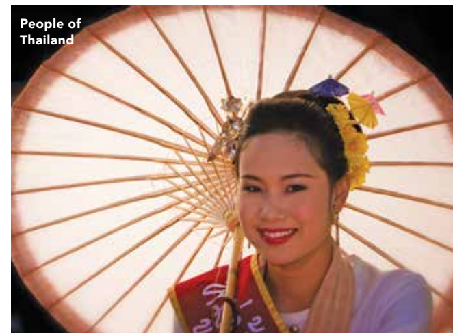
People of Thailand

29 PEOPLE OF TAIWAN. Pray that as believers in Taiwan go about their normal, everyday lives, they will be compelled to share their testimony. Ask God to remove the complacency in their walk and infuse them with the resurrection power to make Christ known.