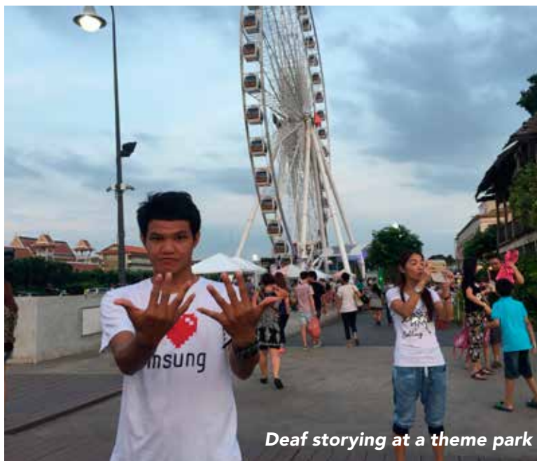
Deaf storying at a theme park

SOUTHERN BAPTISTS: A PRAYING PEOPLE IMPACTING A LOST WORLD