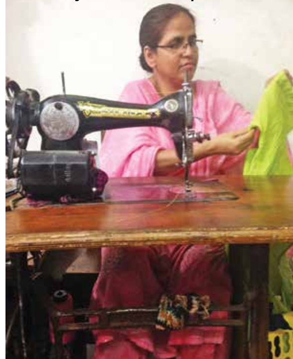
Deaf lady at alteration shop

and watching the programing. Ask God to use this form of media to bring many into a relationship with Him.