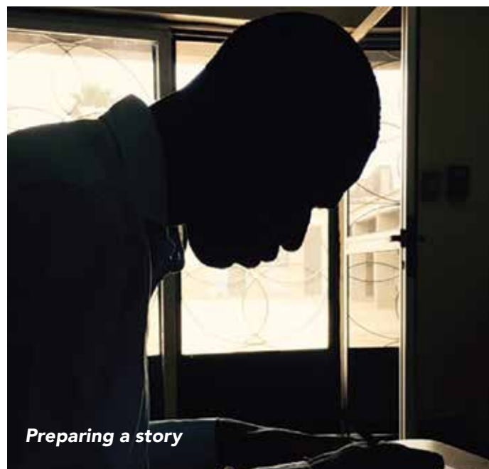
Preparing a story

Pray that these Deaf believers will understand, internalize and utilize the Bible truths being taught through His stories. Pray that they will take these stories and share them with other Deaf people.