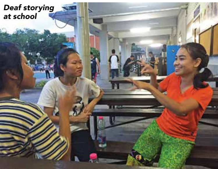
Deaf storying at school

14 BAMBARA OF MALI (BAHM-bah-rah). A chronological Bible storying team has finished a set of 45 stories that is being distributed on SD cards for use in portable devices. Pray that these stories will go out and that the power of the Word will change hearts.