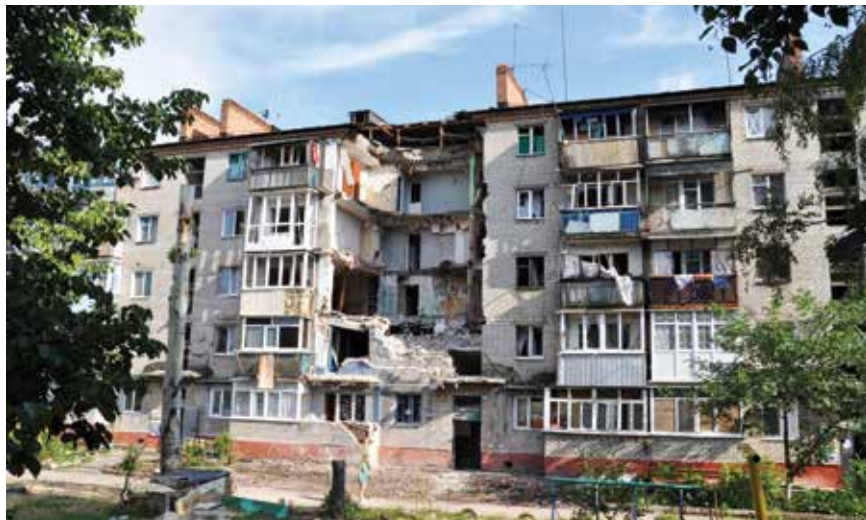
REBIRTH EASTERN UKRAINE

East Asian Christians are ready to be trained and deployed to reach 251 people groups in East Asia with the gospel. These people groups each have a unique language and culture, and national believers are ready to learn how to do cross-cultural missions. Pray as they train and go.