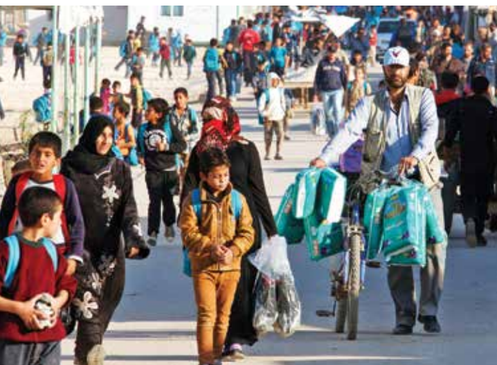
SYRIAN CRISIS RESPONSE

4 KURDISH EVANGELISM, DISCIPLESHIP AND CHURCH PLANTING. The internet is now being used to share Christ with the Kurmanji-speaking Kurds. By visiting a website in their Kurmanji language, the Kurds can request more information about following Jesus. Pray for those who visit the site to be drawn to want to know more.